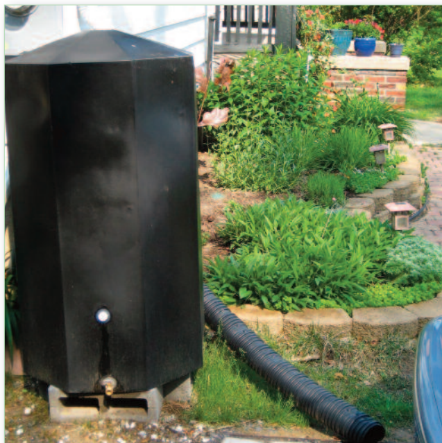
Rain barrel provided to residents as part of the RiverSmart Homes program.