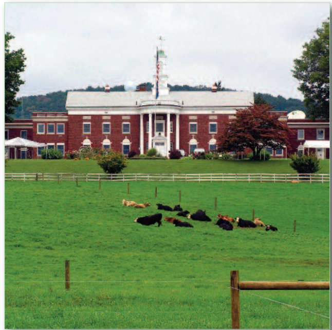
Cattle rest in a paddock of the rotational grazing system installed on the Lycoming County Farm.