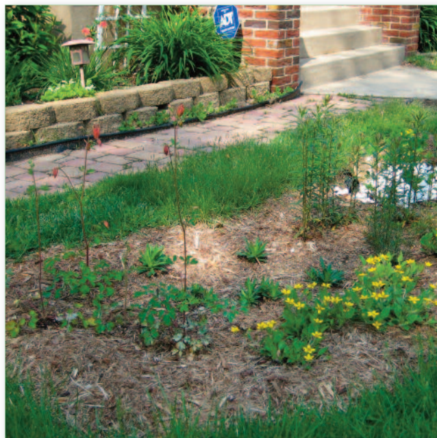
Washington, D.C. rain garden.

With a half-inch of rain, Washington, D.C. faces a problem: Its combined sewage treatment system, which serves one-third of the city, begins to overflow, sending raw sewage and trash from the city's streets into the Anacostia River.