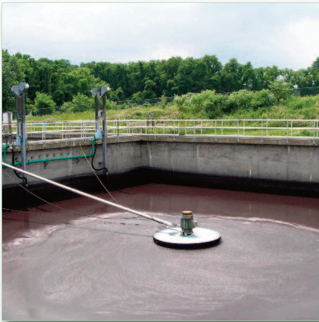
Lycoming County Water and Sewer Authority's wastewater treatment plant.