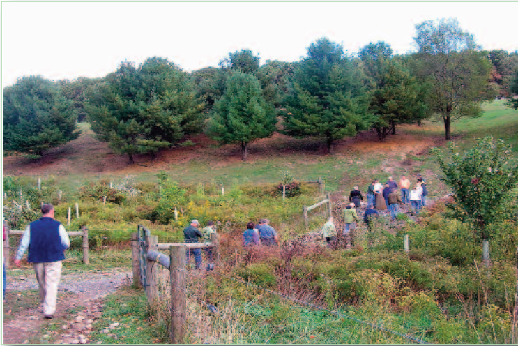
Members of the Lycoming County Chesapeake Bay Tributary Strategy Advisory Committee tour a riparian buffer.

In Pennsylvania, where townships make many of the land use decisions and independent authorities operate the sewage treatment plants, the Lycoming County Commissioners made a bold decision. They chose to invest half a million county dollars to bring the whole community to the table to develop a plan for how to meet water quality standards required to restore the Chesapeake Bay. Their decision, made more than three years ago, led to a model county approach with important benefits for local residents.